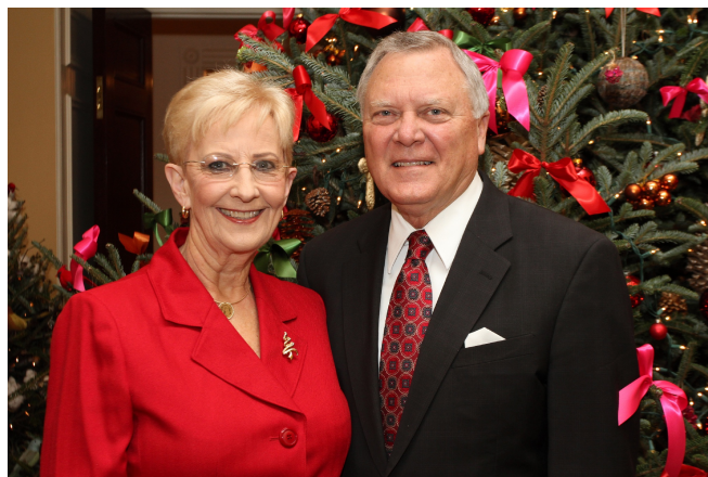
First Lady Sandra Deal and Gov. Nathan Deal